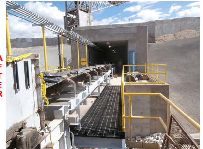
RECLAIM TUNNEL REPLACEMENT PROJECT